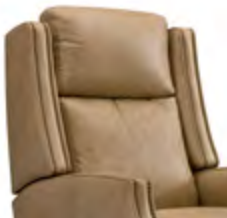
C - SEAMED PILLOW BACK W/ WING