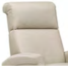
4 - ROLLED BACK