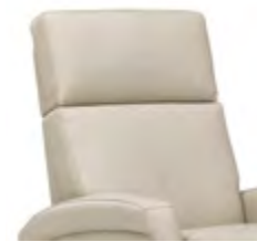
6 - SPLIT BACK