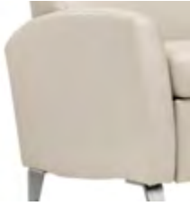
0 - FLARED ARM