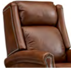
A - BUSTLE BACK