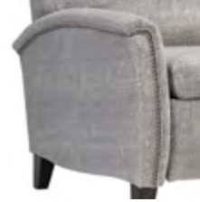
J - PADDED ARM