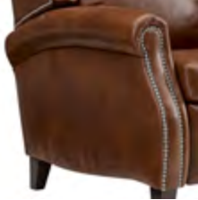
H - SWOOPED ROLLED ARM