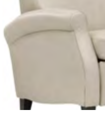
2 - ROLLED ARM