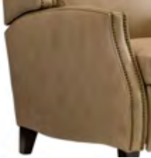
I - SLOPED TRACK ARM