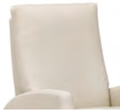
5 - SOLID BACK*