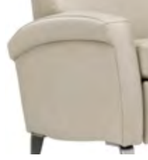
3 - KEY ARM