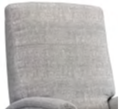
D - SEAMED PILLOW BACK*

*Articulating headrest is not available with (5) Solid Back or (D) Seamed Pillow Back option.