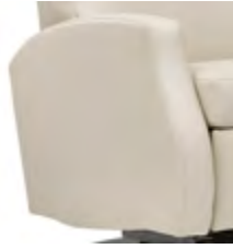
1 - TRACK ARM